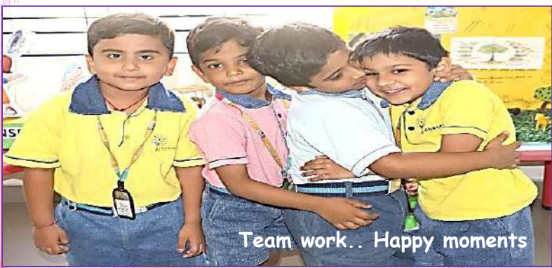
Team work.. Happy moments