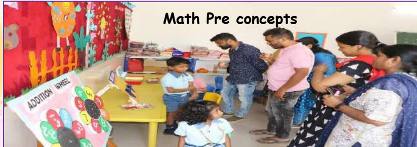
Math Pre concepts